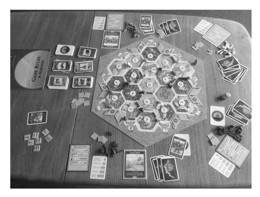
Easy? Well, there is some luck involved too, and we learn as we go.

The basic concept for "Settlers" is simple. Players settle on the (fictitious) island of Catan and work the land to produce resources - wood from its forests, ore from its mountains, grain from its fields, brick from its hills, and wool from the sheep in its pastures. Using these resources players build roads, settlements, and cities, gaining points as they do so. The winner is the first player to reach 10 points.